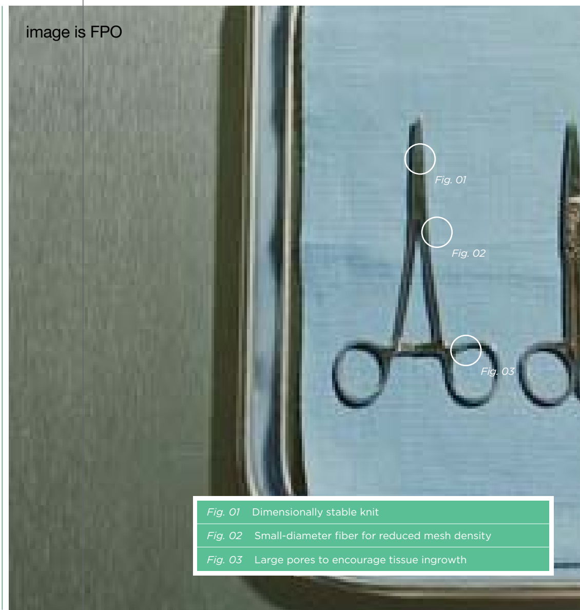
Mesh image descriptor