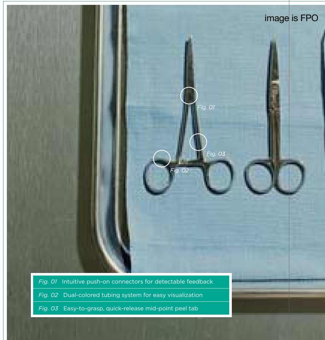
Fig. 01 Intuitive push-on connectors for detectable feedback Fig. 02 Dual-colored tubing system for easy visualization Fig. 03 Easy-to-grasp, quick-release mid-point peel tab

Better thinking produces breakthroughs. Like the Align™ System's improved sheath system, with intuitive push-on connectors that connect you to the implant—easily, seamlessly. Better thinking means a dual-colored tubing system for easy visualization during cystoscopy. And better means smart developments like a mid-point peel tab with an easy-release function, which means more accurate, more controlled mesh placement.